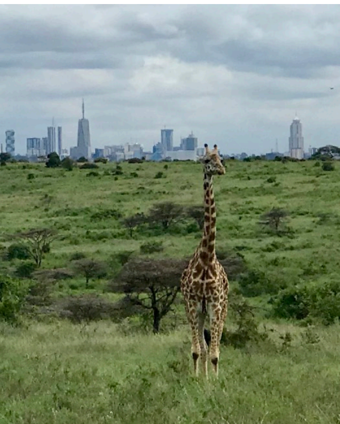
Nairobi National Park, Kenya

A gentle ascent by foot to the lodge will bring you to the lounge area where you will be welcomed, receive a brief orientation, and enjoy a light, late evening meal before being escorted to the Terrace Room for a much needed rest.