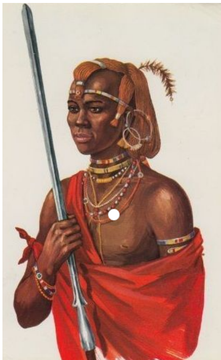
Painting by Joy Adamson