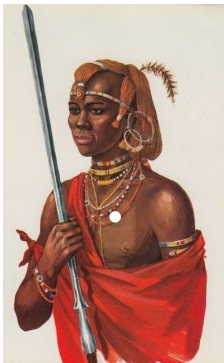
Painting by Joy Adamson

This pre-tour is designed to occur before the Karibu Kenya Safari . You'll arrive in Kenya about 4 days' early and the end of this tour will correspond with the beginning of Karibu Kenya 2026.